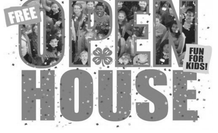
Annual 4-H Open House September 26th, 2019 6:30 - 7:30 p.m.